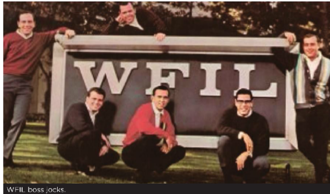
WFIL boss jocks.

transistor and other “portable” radios — onto beaches and backyards and into sports venues (listening to play-by-play while watching the event) and even into schools as we tried to sneak a listen to the world series played in the afternoons. And who could forget trying to go to sleep on those September 1964 evenings listening to the Phillies' collapse with By Saam , Bill Campbell and Richie Ashburn behind the mike. (Yes, I was listening when Chico Ruiz stole home with Frank Robinson at bat on Sept. 21, 1964 — the start of the Phillies' collapse.)